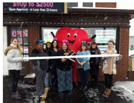
MJ Cares Accounting & Insurance Services Grand Opening