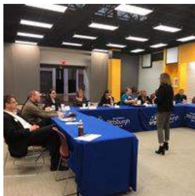
On-boarding for Small Business presented by: The Bradley Partnership