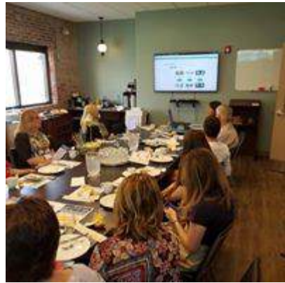
Coffee & Connections hosted by: FOREVER