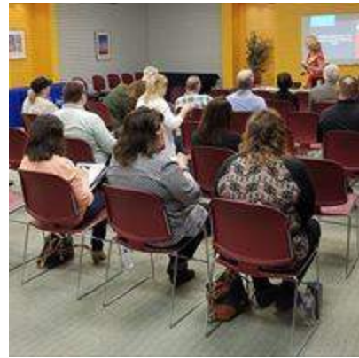
Medical Marijuana in the Workplace: An HR Perspective sponsored by: Allegheny Valley Hospital