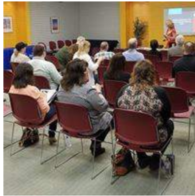
Medical Marijuana in the Workplace: An HR Perspective sponsored by: Allegheny Valley Hospital