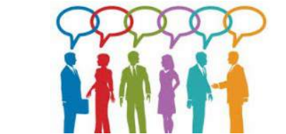
Meet & Greet with the Westmoreland Co. Chamber