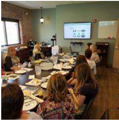
Coffee & Connections hosted by: FOREVER