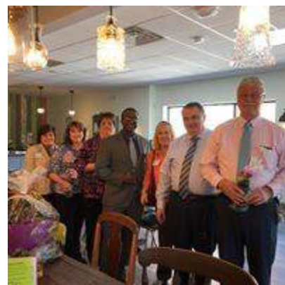
Administrative Professionals Day Luncheon