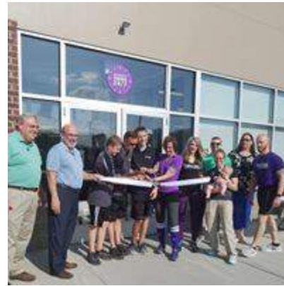
Anytime Fitness, Cheswick Fitness Center Grand Opening