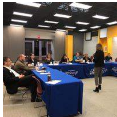
On-boarding for Small Business presented by: The Bradley Partnership