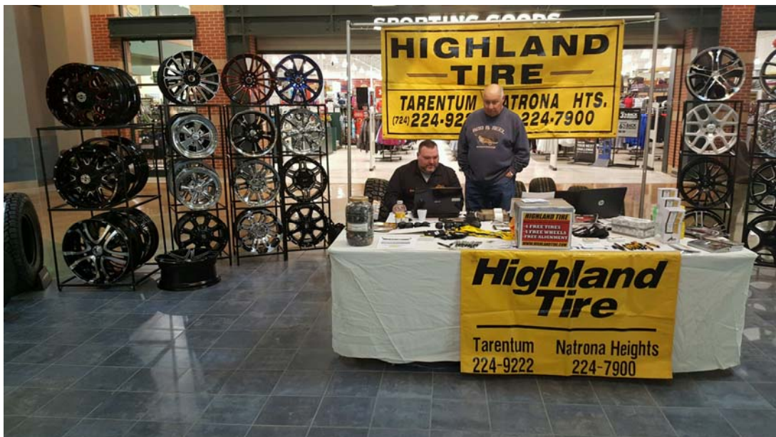
(2017 HomExpo Highland Tire Booth)

Highland Integrity Alignment 1701 Broadview Blvd. Natrona Heights, PA 724-224-5900